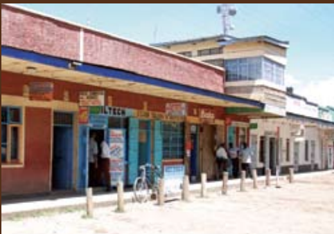
The local retail environment

Whether you can spare a few days or several months, we can tailor business assignments to fit your skills, timeframes and aspirations.